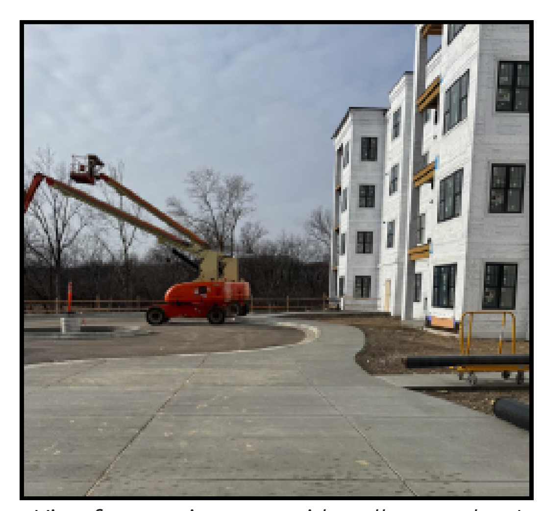
View from main entry - sidewalks complete!